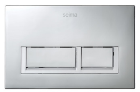
Chrome metallic finish