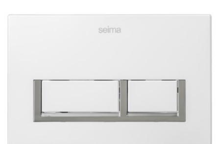
White semi-matte finish