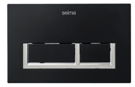
Black semi-matte finish