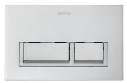
Satin metallic silver finish